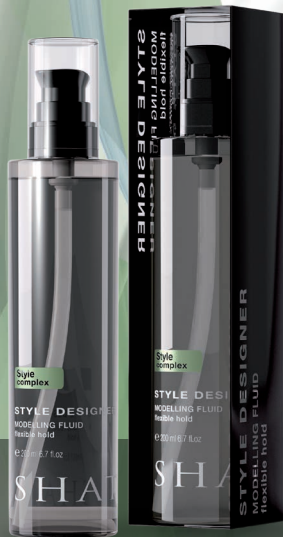
STYLE DESIGNER 200 ml