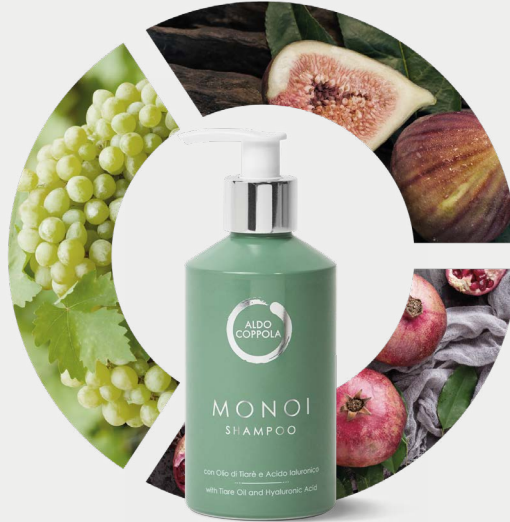
Fig and Pomegranate natural sources of sugars and vitamins, with antioxidant action

Stem Cells from Unripe Grapes with powerful anti-radical protection